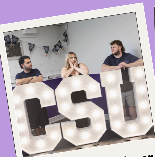
Officers on Tour