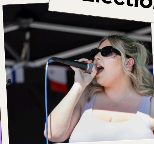
Battle of the Bands