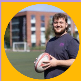
WILL - VP STUDENT LIFE