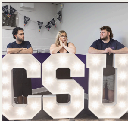
Officers on Tour